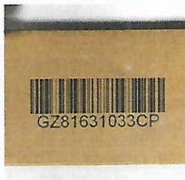
Dynamic security barcode