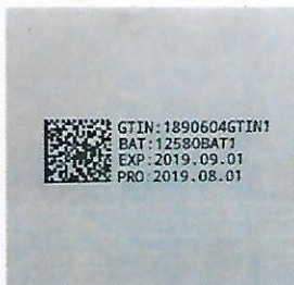
GS1 Data Matrix