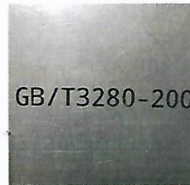
HD bold font