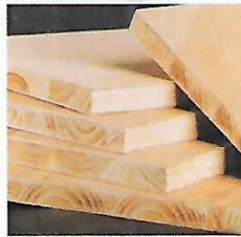
Furniture and wood